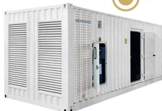
Image shown might not reflect actual Genset