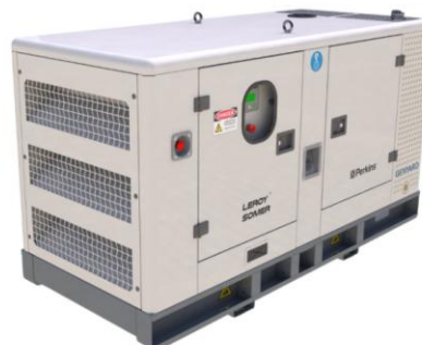
Image shown might not reflect actual Genset