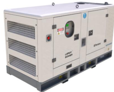
Image shown might not reflect actual Genset